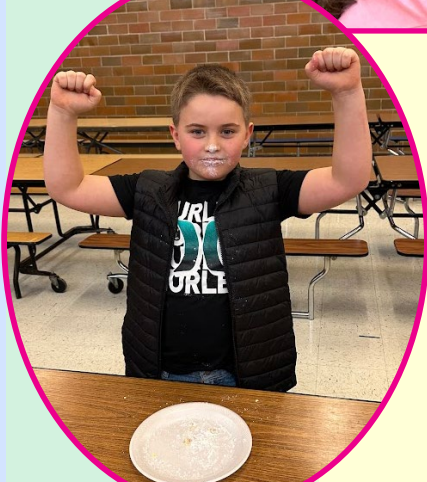
The 2nd graders were treated to a donut party from the Renville County Sheriff's Office for bringing in the most weight in food for the holiday food drive. They had fun playing a few games before enjoying their donuts.