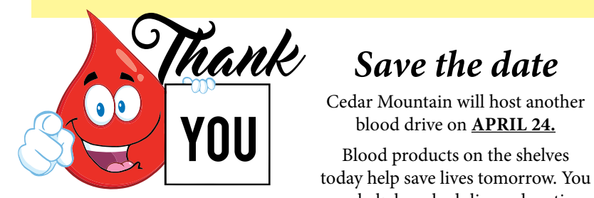
Thank you to everyone who donated at our February 5 blood drive! We had 52 donors and 5 first time donors!